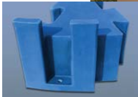
Anchor points and raised castle projections restrain lateral movement.

Assmann Corporation has tested this stand to over 300,000 lbs. of crush force. This test was conducted using two 200,000 lb. hydraulic actuators and a custom-made load distribution fixture. The stand was loaded at a compression rate of 7,000 lbs. per minute to a load of 307,000 lbs. Multiple sensors were placed on the stand to record deflection and no deflection was found greater than a 1/16".